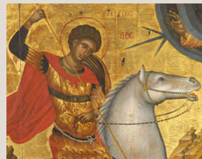
HERE GOD SHOWS HIS BEAUTY TO THOSE WHO LOVE HIM. HERE THE SOUL SEES ITSELF AND CHRIST WHO APPEARS IN IT, AND IT REJOICES IN THE VISION OF HIM. HERE IT SEES THE MARVELOUS BEAUTIES OF THE ANGELS WHO STAND IN WONDER BEFORE THE GLORY OF THE ONE WHO LIVES ETERNALLY - JOHN THE ELDER OF DALYATHA

They practiced asceticism, and showed love to friends and enemies alike, and devoted their lives to the worship of the One God even in the face of persecution and martyrdom. Their example paves the way for us in our own journey of faith and their intercession aids us on that journey. May the prayers of the Righteous and Just be a rampart for us!